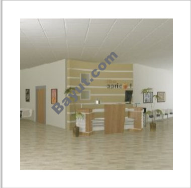
The Apricot Interior View

For larger view click link below http://www.bayut.com/uae_dubai_offices/the_apricot_office_space_for_sale-445136.html