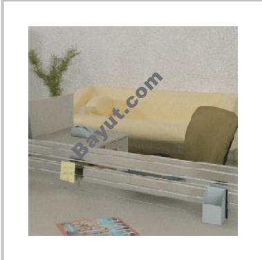
The Apricot Sitting Area