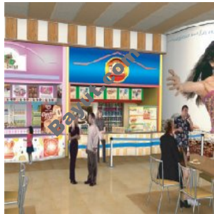
The Apricot Cafeteria