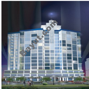
The Apricot Exterior View 2