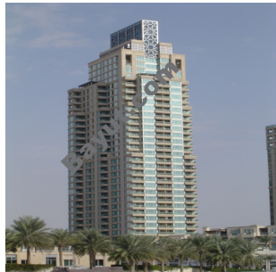
Dubai Marina Towers Al Mass