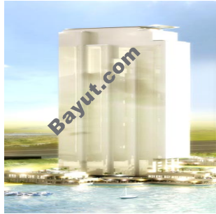
Jumeirah Business Centre 4 Exterior View