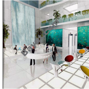
Jumeirah Business Centre 4 Interior View