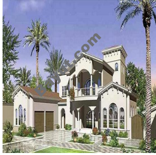
Signature Villas Exterior View