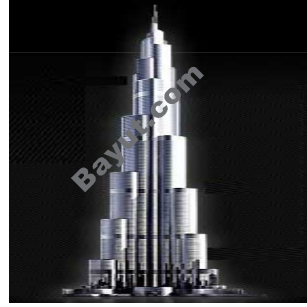
Burj Dubai Exterior