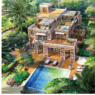
Balqis Residence Villas Exterior View