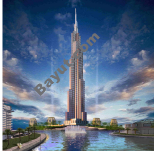
Burj Dubai Exterior6