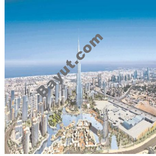
Burj Dubai Exterior3