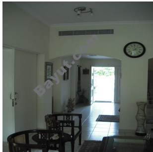
Meadows 4 - 5 Bedrooms Villa