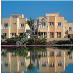
Meadows 4 &#45; 5 Bedrooms Villa