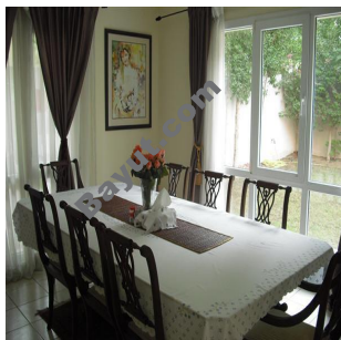
Meadows 4 - 5 Bedrooms Villa