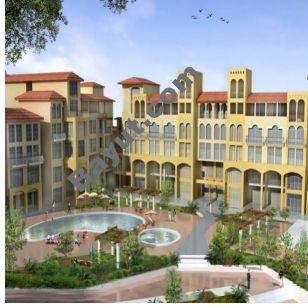
Fortunato Exterior View