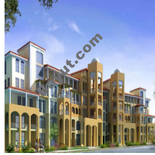
Fortunato Exterior View 2