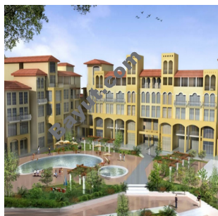
Fortunato Exterior View