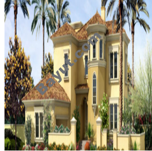
Alvorada Arabian Ranches Exterior2