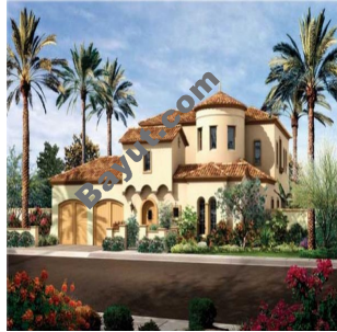
Alvorada Arabian Ranches Exterior