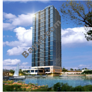
Liwa Heights Exterior View 2