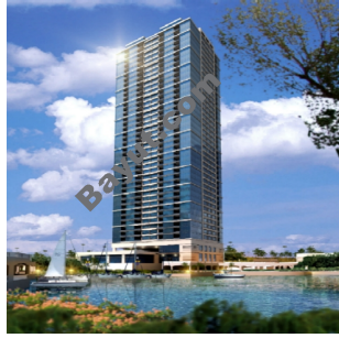
Liwa Heights Exterior View 2