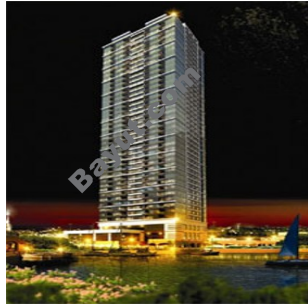
Liwa Heights Exterior View 1