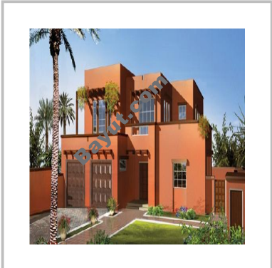
Garden Homes Exterior View 2