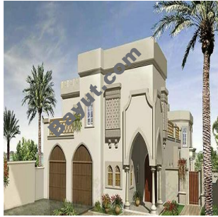
Garden Homes Exterior View 4