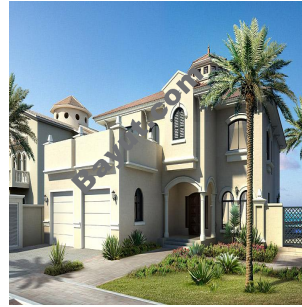
Garden Homes Exterior View 4