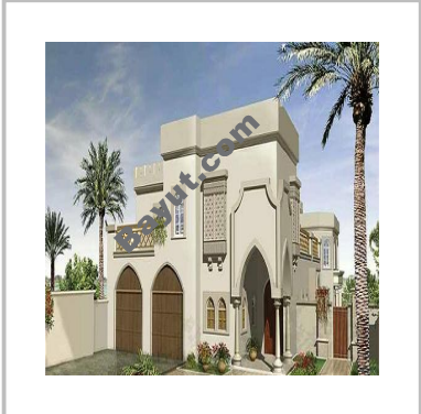
Garden Homes Exterior View 4