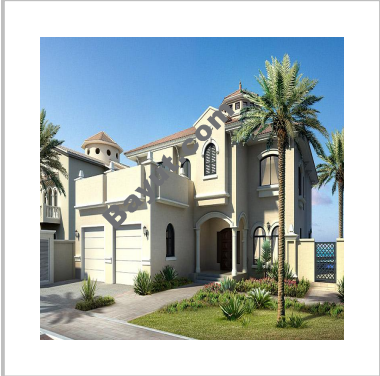
Garden Homes Exterior View 4

For larger view click link below http://www.bayut.com/uae_dubai_villas/garden_homes_palm_jumeirah_villa_for_sale-437659.html