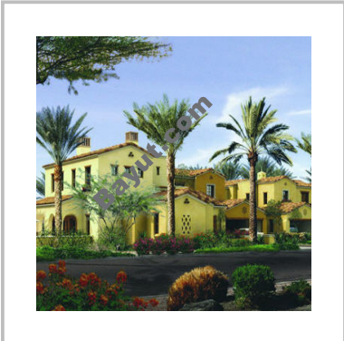
Umm Al Quwain Marina Exterior View