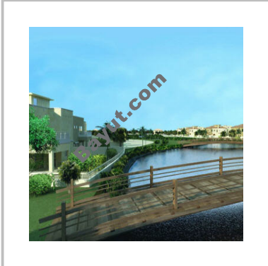
Umm Al Quwain Marina Exterior View 4