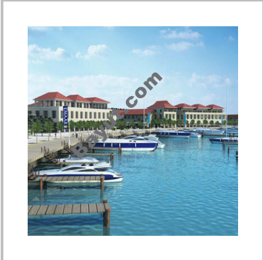
Umm Al Quwain Marina Exterior View 3