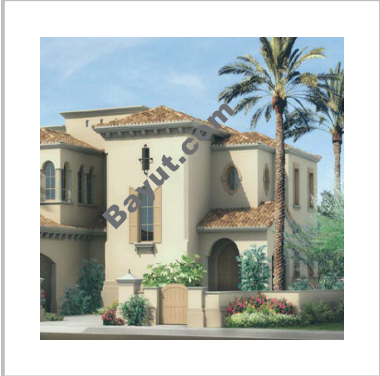
Umm Al Quwain Marina Exterior View 5

For larger view click link below http://www.bayut.com/uae_umm_al_quwain_villas/umm_al_quwain_marina_villa_for_sale-437401.html