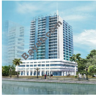
Moon Tower Exterior