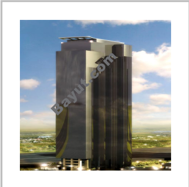
Jumeirah Business Centre 1 Exterior View