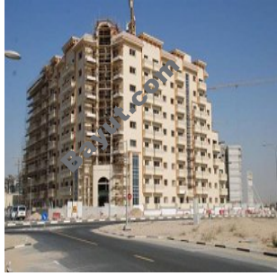
Building View 1