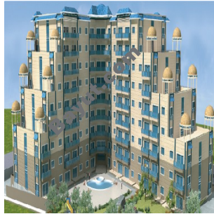
The Dunes Exterior View 2