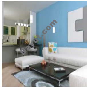
The Dunes Lounge