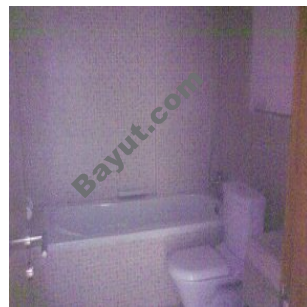
Attached Bath Room with Bed Room