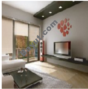
The Dunes TV Lounge

For larger view click link below http://www.bayut.com/uae_dubai_apartments/the_dunes_one_bedroom_apartment_for_sale-436902.html