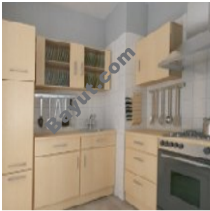
The Dunes Kitchen