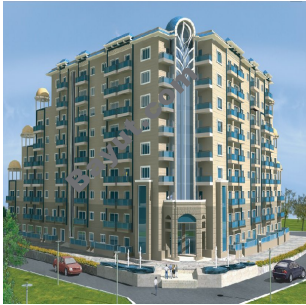
The Dunes Exterior View 1