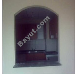
Kitchen from outside hall