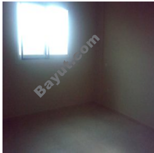
Kitchen inside with 7 home appliances