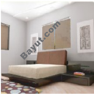
The Dunes Bedroom