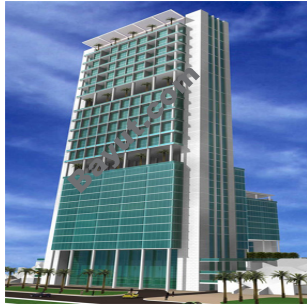
Liberty House Exterior View 1