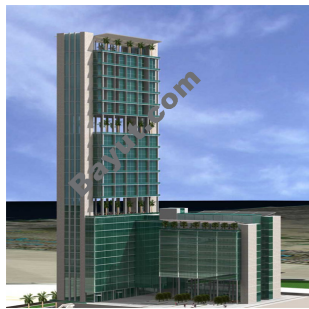
Liberty House Exterior View 2