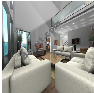
Liberty House Lounge