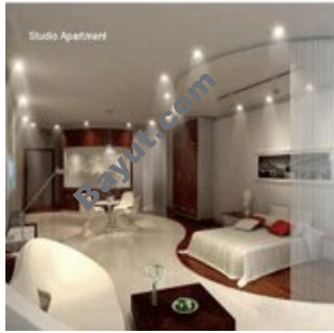
Rufi Twin Tower Bedroom