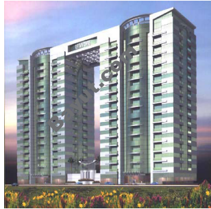
Rufi Twin Tower Exterior View