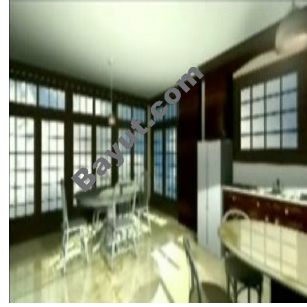
Rufi Twin Tower Interior View