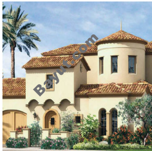
Umm Al Quwain Marina Exterior View 2