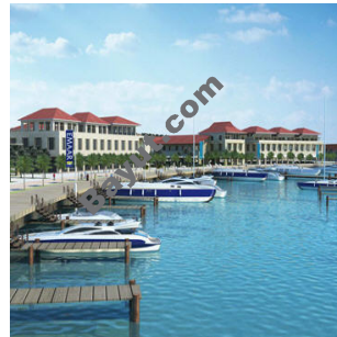
Umm Al Quwain Marina Exterior View 3