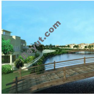
Umm Al Quwain Marina Exterior View 4