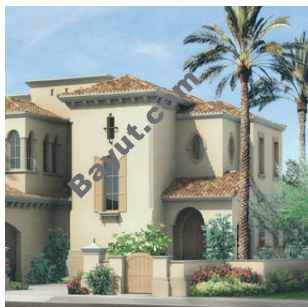
Umm Al Quwain Marina Exterior View 5