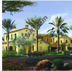
Umm Al Quwain Marina Exterior View