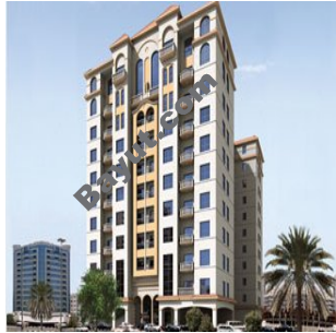
Riviera Residence Exterior View