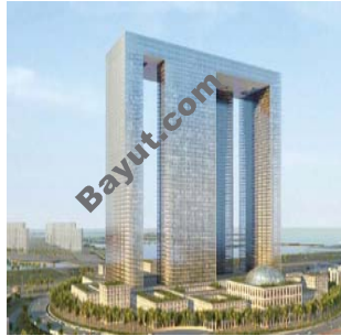
Dubai Pearl Exterior View