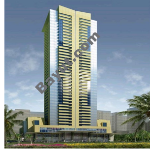
Exterior View 2