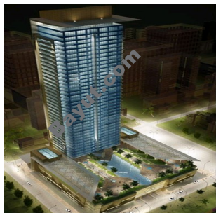
Exterior View 5