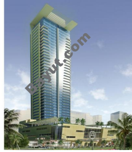
Burj Al Faraa