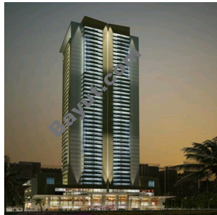
Exterior View 3