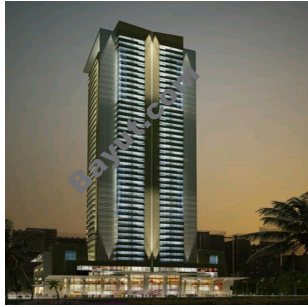
Exterior View 3