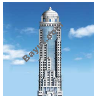
The Dome Exterior View 2