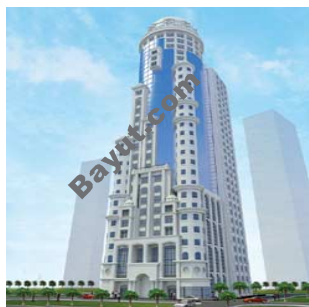
The Dome Exterior View