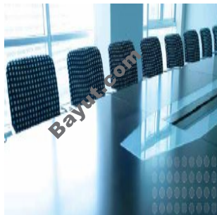
Schon Business Park Meeting Room