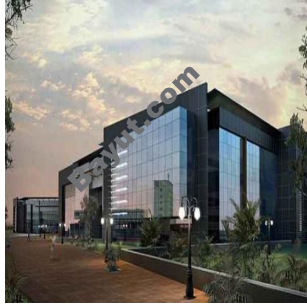
Schon Business Park