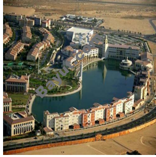
Schon Business Park