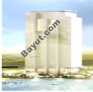
Jumeirah Business Centre 4 Exterior View