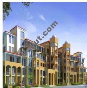
Fortunato Exterior View 2