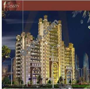
Jouri Exterior View