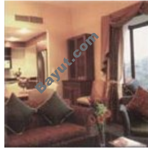
Jouri Interior View