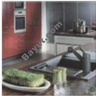
Jouri Interior View 2