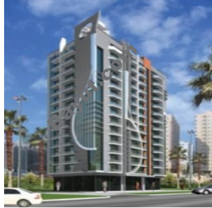
WestGate Apartment 3 (Tennis Tower) Exterior