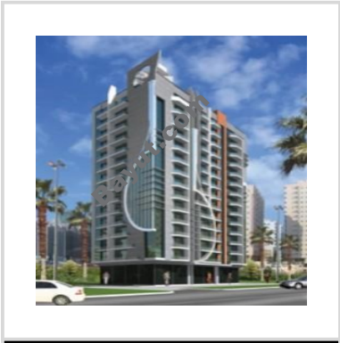
ate Apartment 3 (Tennis Tower) Exterior