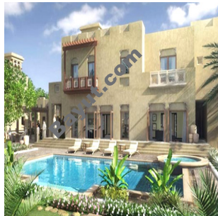
Al Furjan Al Hejaz