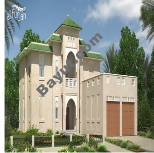
Al Furjan Quortaj