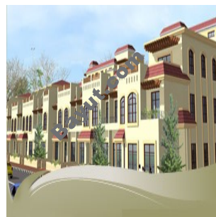
Diamond Views 1 Exterior View 2