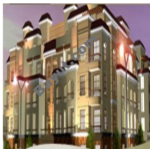
Diamond Views 1 Exterior View