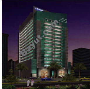
Exterior View at Night