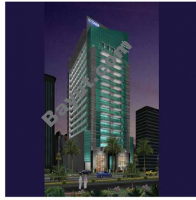
Apartment For Sale