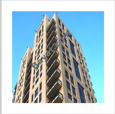
Emaar Towers Exterior View

For larger view click link below http://www.bayut.com/uae_dubai_apartments/emaar_towers_one_bedroom_apartment_for_sale-417788.html