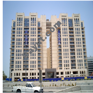
Emaar Towers Exterior View 3