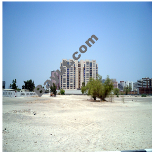
Emaar Towers Exterior View 4