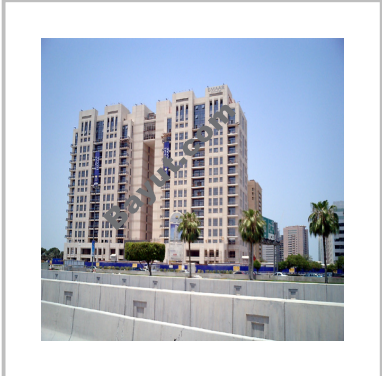
Emaar Towers Exterior View 2