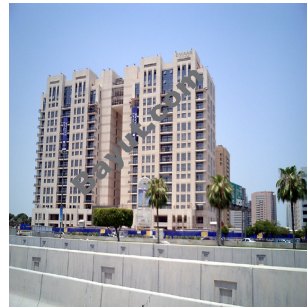
Emaar Towers Exterior View 2