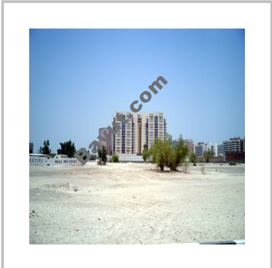
Emaar Towers Exterior View 4