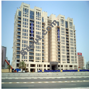
Emaar Towers Exterior View 5