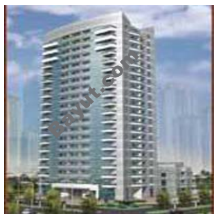
Marina Diamond 5 Exterior View