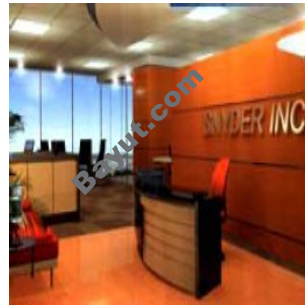
Park Avenue Interior View 1