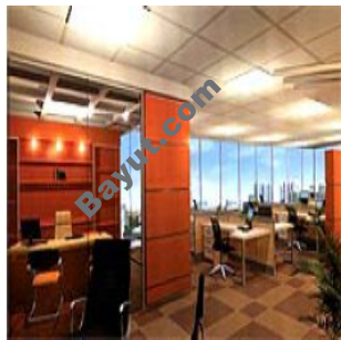
Park Avenue Interior View 2