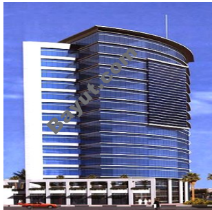
Park Avenue Exterior View