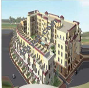
Diamond Views 2 Exterior View