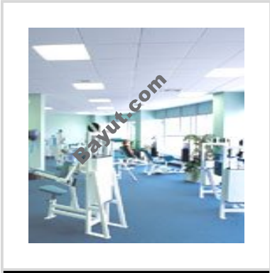
La Riveiera Gym