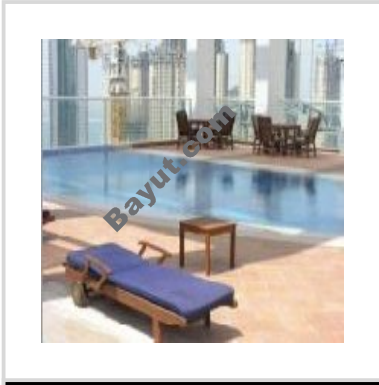
La Riveiera Swimming Pool

For larger view click link below http://www.bayut.com/uae_dubai_apartments/la_riviera_duplex_apartment_for_sale-415691.html