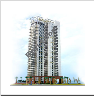
La Riveiera Exterior View 1