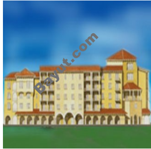
Spain Exterior View