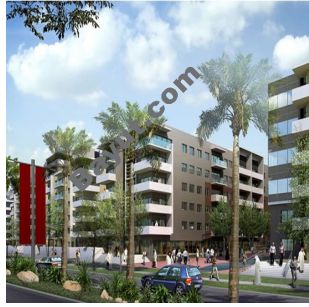
Exterior View 1