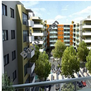
Exterior View 2