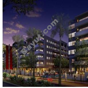
Exterior View 3