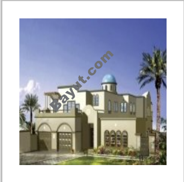
Garden Homes Exterior View 3