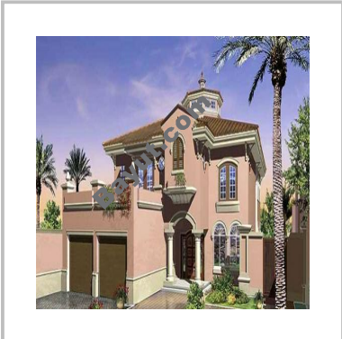
Garden Homes Exterior View