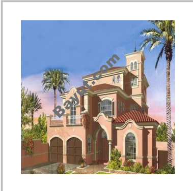
Garden Homes Exterior View 2