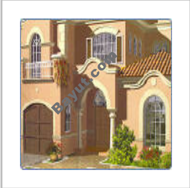
Garden Homes Exterior View 5

For larger view click link below http://www.bayut.com/uae_dubai_villas/garden_homes_palm_jabel_ali_villa_for_sale-413690.html