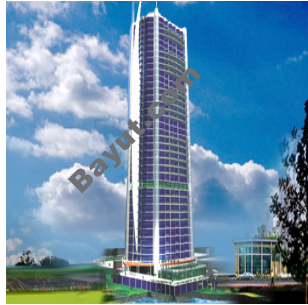
New Dubai Gate II