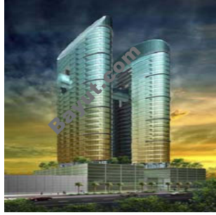
Emirate Financial Tower Exterior View 2