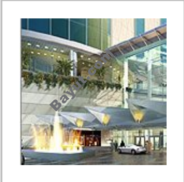
Emirate Financial Tower Exterior View 3