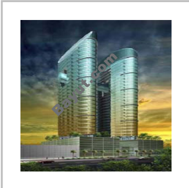
Emirate Financial Tower Exterior View 2