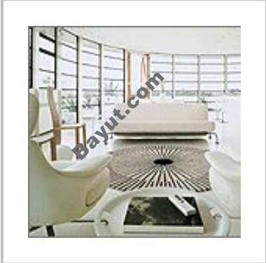
Emirate Financial Tower Interior View