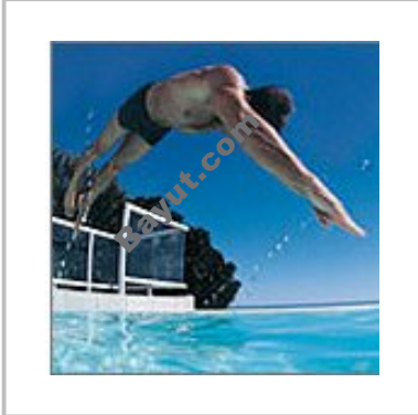
Emirate Financial Tower Swimming Pool

For larger view click link below http://www.bayut.com/uae_dubai_offices/emirate_financial_towers_office_for_sale-413020.html