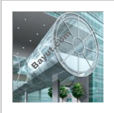
Emirate Financial Tower Exterior View 4