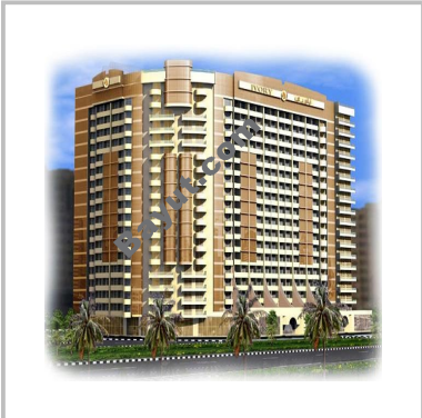
Ivory Tower Exterior View