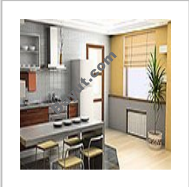
Ivory Tower Interior View 2

For larger view click link below http://www.bayut.com/uae_dubai_offices/ivory_tower_office_for_sale-412385.html