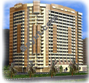
Ivory Tower Exterior View