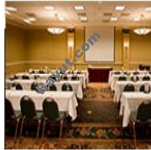
Ivory Tower Interior View