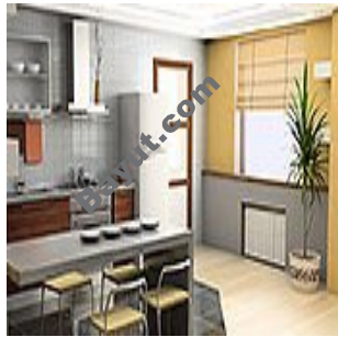
Ivory Tower Interior View 2