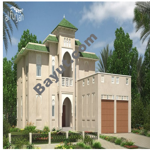
Al Furjan Quortaj

For larger view click link below http://www.bayut.com/uae_dubai_villas/al_furjan_villa_for_sale-412223.html