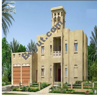
Al Furjan Dubai