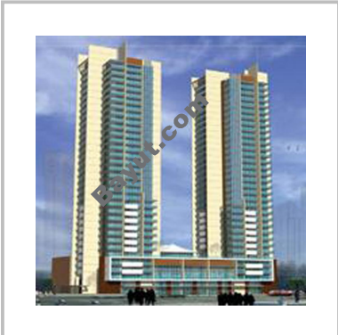
Hydra Twin Tower Exterior View 1