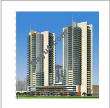
Hydra Twin Tower Exterior View 2