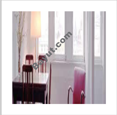
Hydra Twin Tower Living Area

For larger view click link below http://www.bayut.com/uae_dubai_apartments/hydra_twin_tower_lovely_studio_apartment_for_sale-411741.html