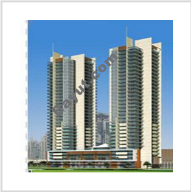
Hydra Twin Tower Exterior View 2