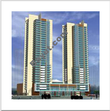
Hydra Twin Tower Exterior View 1