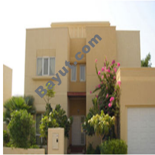
The Meadows Exterior view 2