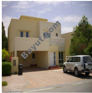
The Meadows Exterior view 4

For larger view click link below http://www.bayut.com/uae_dubai_villas/the_meadows_villa_for_sale-411526.html