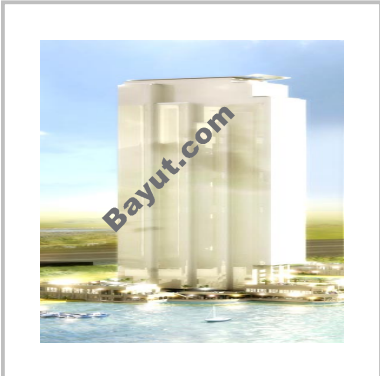
Jumeirah Business Centre 4 Exterior View