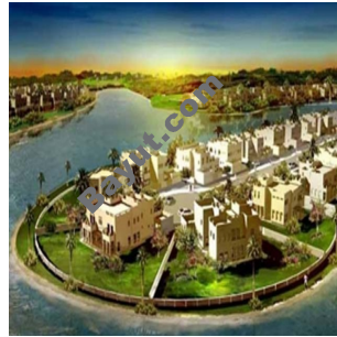
The Meadows Exterior view 3