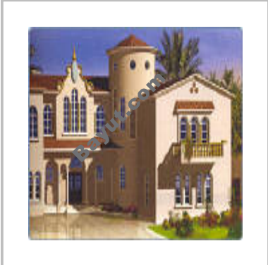
Signature Villas Exterior View 3

For larger view click link below http://www.bayut.com/uae_dubai_villas/signature_villas_villa_for_sale-410749.html