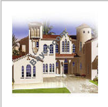
Signature Villas Exterior View 2