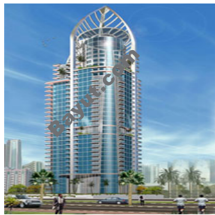
Al Saqran Tower Exterior View